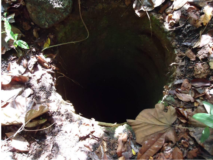
Handmade deep and narrow hole in North Mandiana