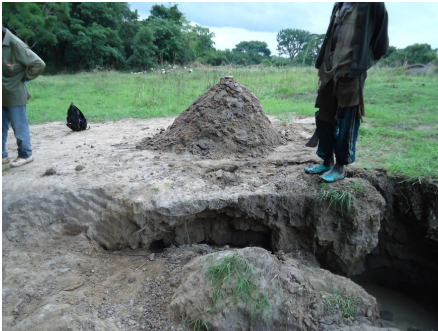
Mine craft open in South Mandiana